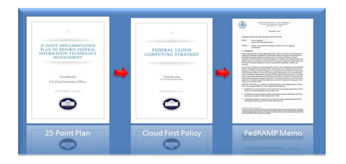
Figure I: Evolution of Government Cloud Policy

On December 9, 2010, the Office of Management and Budget (OMB) released 25 Point Implementation Plan to Reform Federal Information Technology Management. Point 3 under this plan created the Cloud First Policy, which requires Agencies to use cloud-based solutions whenever a secure, reliable, cost-effective cloud option exists. In follow-up to the 25 Point Plan, on February 8, 2011, OMB released the Federal Cloud Computing Strategy, giving agencies practical guidance on considerations and practical methodologies for moving to the cloud. Finally, on December 8, 2011, OMB released the Security Authorization of Information Systems in Cloud Computing Environments – also known also as the FedRAMP Policy Memo – mandating that for all agency use of cloud services, the agencies use FedRAMP for their risk assessments, security authorizations, and granting of ATOs, and ensure applicable contracts require CSPs to comply with FedRAMP requirements.