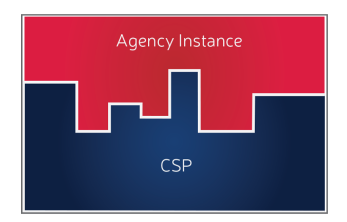
Figure 2 shows how an agency instance completes the overall security responsibilities, depicting the overall authorization boundary when using a cloud service. The agency instance represents the agency's responsibility when completing a security authorization – whether it is unique application needs, customization, or required integration with agency back ends. An example of this would be multi-factor authentication. The CSP would address the capabilities for multi-factor authentication, but the agency instance would have to fully implement this for each agency user.

agencies. Agencies need to think of cloud services as the building block upon which their end service exists. This building block offers varying degrees of completeness depending on if an agency is using an Infrastructure, Platform or Software as a Service. Regardless of the service being used, an Agency's ATO must include the entire application –and there will always be responsibility differences between CSPs and agencies as shown below in Figure 2.